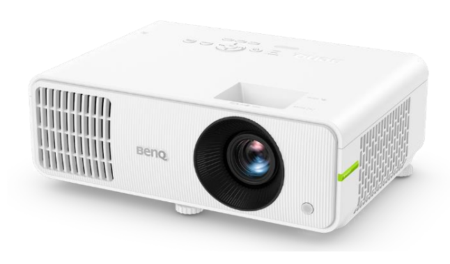
303.5 (W) x 112.4 (H) x 241 (D) mm

Introducing EH700, an Android-based smart projector designed specifically for education. This 4,000-lumen high-brightness laser projector produces true-to-life visuals that complement your smart classroom. With Android built-in, EH700 is an all-in-one projector that eliminates the need for a separate PC, making digital learning more accessible than ever. Teachers and students can open apps directly from the BenQ EH700, easily accessing online resources in the classroom.